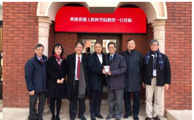
Photo with Representatives of Guanghua Engineering Science and Technology Award Foundation