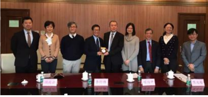
Photo with Representatives of Ministry of Science and Technology