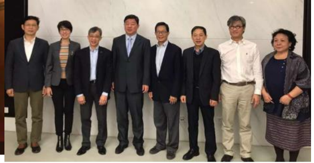
Photo with Representatives of China Association of Science and Technology