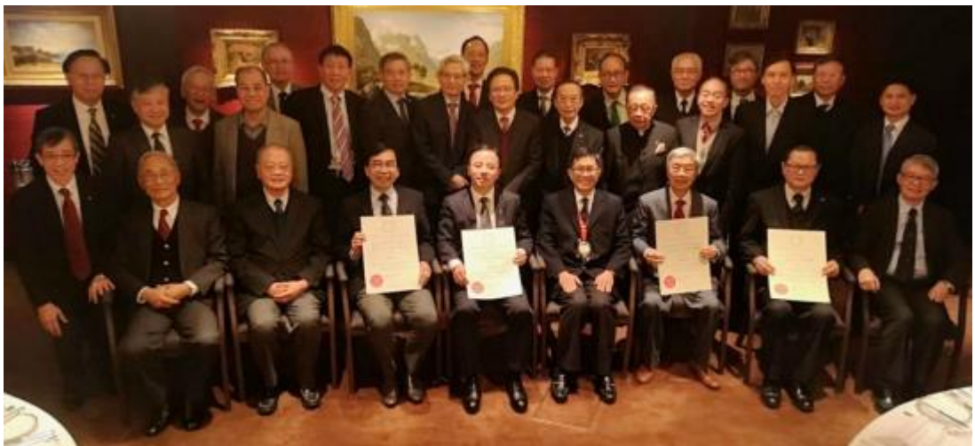
New Fellows 2018 at the Welcome Dinner